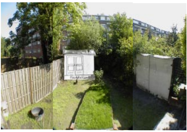
-view from apartment showing projection screen (to right), grass carpet for podium (centre).